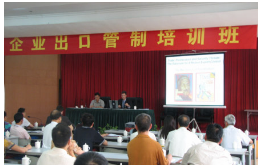
Enterprise Outreach Event, Kunming, September 2006