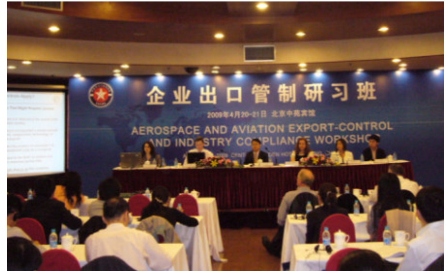
Enterprise Outreach Event, Beijing, April 2009