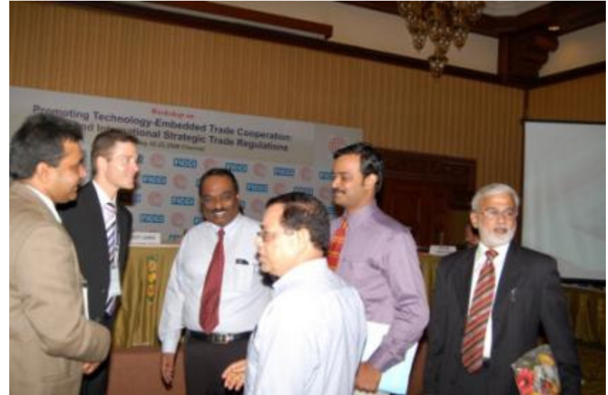
Enterprise Outreach Event, Chennai, May 2008